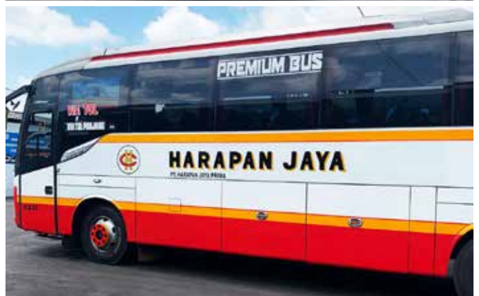
The smooth transition from diesel to B35 biodiesel was made possible by using Delo Gold Ultra SAE 15W-40 engine oil.

To find out more, visit www.caltex.com/business