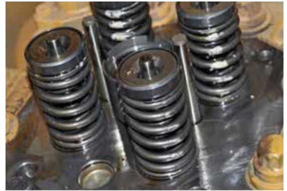
Caterpillar G3516 TALE E+ valve springs at end of Approval Test (8,089 hours)

HDAX 9200 Low Ash Gas Engine Oil is a proven performer in protecting vital components and bearings in reciprocating engines.