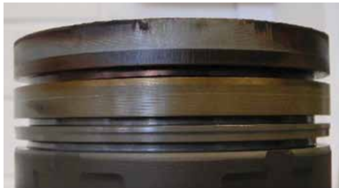
MWM TCG 2016 piston at end of Approval Test (9,644 hours) showing minimal deposit formation

While a number of OEMs recommend operating their engines with a minimum 83% to 100% load, customers often de-rate their engines below these recommendations to as low as 50%. Operating at these levels can cause inadequate cylinder pressures and interferes with the engine's ability to provide a full, continuous flow of oil to sufficiently lubricate critical engine parts. This also may allow oil to leak past the piston rings into the combustion chamber, which can cause deposits. HDAX ® 9200 Low Ash Gas Engine Oil contains robust additive chemistry that helps minimize deposits.