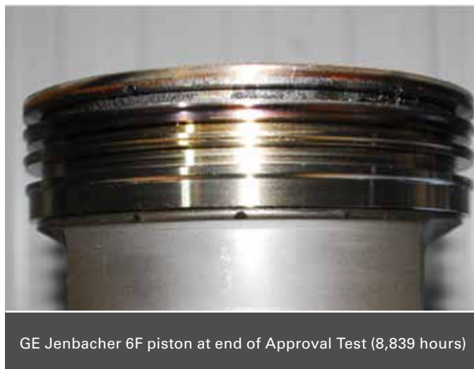
GE Jenbacher 6F piston at end of Approval Test (8,839 hours)

Base Number (BN) is used to indicate an engine oil's alkaline reserve. Many OEMs have established an engine oil condemning limitation of 50% of new oil BN or Total Base Number (TBN), based on ASTM D 2896. An engine oil with a high initial BN does not necessarily predict the actual longevity of the alkaline reserve or the rate of depletion. Many competitive engine oils advertise high BN numbers, but the alkalinity reserve actually depletes rapidly. HDAX® 9200 Low Ash Gas Engine Oil is formulated with a typical BN of 4.2 mgKOH/g, which may be lower than some of our competitors' top engine oils. However, it consistently depletes at a slower rate, remaining active to help prevent harmful acids from damaging your engine.